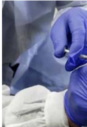
Teams will be formed for the survey like a polling station. Each municipal corporation

corporation and the health officials have started preparations. A list of health workers, Corona Warriors, the elderly and people with comorbidity is being prepared for all these officers. Gujarat officials have started working in coordination with the team of the Center. The list also includes 2.59 lakh people over the age of 50 and a list of people over the age of 50. A list of 2.59 lakh people over the age of 50 has been prepared. Also, a list of comorbid people under the age of 50 has been compiled. Arrangements have been made to keep the vaccine after the vaccine has arrived, the cholesterol has been audited. Work is underway to increase the capacity of the cholesterol and also to make arrangements for the vaccine to be given to the people after its arrival. AMC had already sent a list of 40,000 health workers and started preparations for giving corona vaccine to the Ahmedabad Municipal Corporation. Regarding the distribution of the vaccine, a senior official of the corporation said in a conversation with Divyabhaskar that the vaccine will be given in 4 stages, in which the first health workers will be vaccinated, for which Force has been formed at all 33 Districts and 248 Taluka and Corporation level of the State for vaccination. Following this order, all the district collectors of the state, the commissioners of the